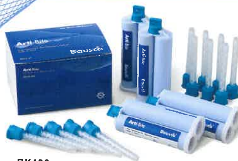
BK400 Cartridge 50ml X4 Mixing Tips(Green)X12

Dimension variation after 24hr: -0.1% or less