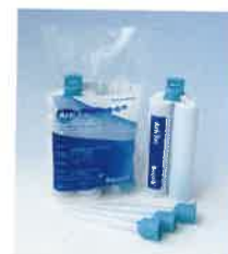
BK401 Cartridge 50ml X1 Mixing Tips(Green)X3